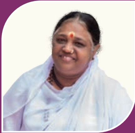
Sri Mata Amritanandamayi Devi Chancellor